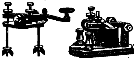
EUREKA No. 1.

Sounder, - - - - $1.75 Key, - - - - 1.50 Complete Outfit - - - - 4.75