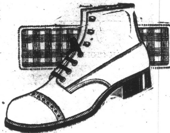
MEN'S TAN CALF BLUCHER, with rubber heels. The Young Man Boots, only