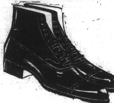
MEN'S CANADIAN ARMY BOOT—Good heavy solid leather boot, only $6.75. Same style for boys, sizes 1 to 5, only $4.00.

We can fit correctly any of these styles of footwear with Rubbers.