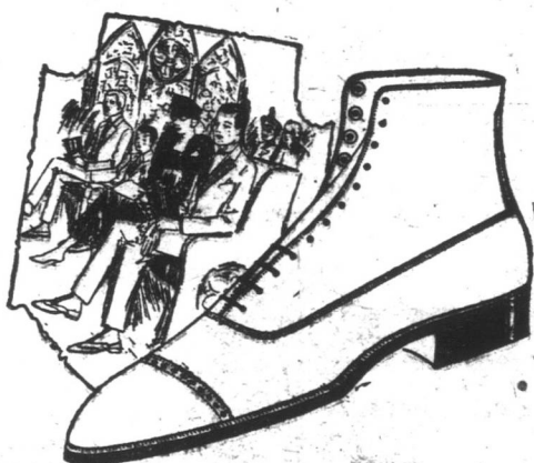
MEN'S BLOCK CALF BOOTS, pointed toes, only $6.00 per pair. Regular $10.00 value. Secure your size to-day.