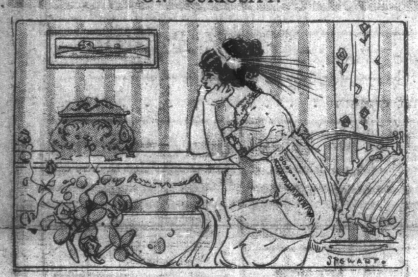
THE MODERN PANDORA

THE FIRST WORD Men do not to herself, unless I drew them out of her