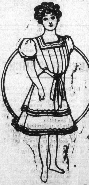
Fined lining of plaited embroidered silk. The top and bottom edges are trimmed with valenciennes lace and the plait held down with crossbars of insertion.

The lingerie belts this summer are very elaborate. Those of embroidered muslin and linen are supplemented with bands of velvet that can be easily detached when the belt needs cleaning. A very dainty affair is made on a stiff