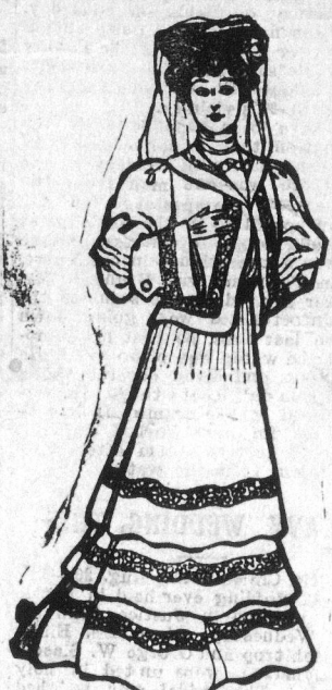
GOWN OF ECRU SHANTUNG.

Natural colored linen coats for auto-mobiling with fancy collar and cuffs. Decorations of soutache braid are worn.