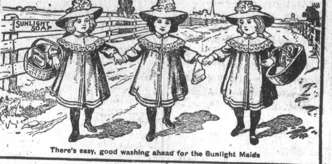
There's easy, good washing ahead for the Sunlight Maids