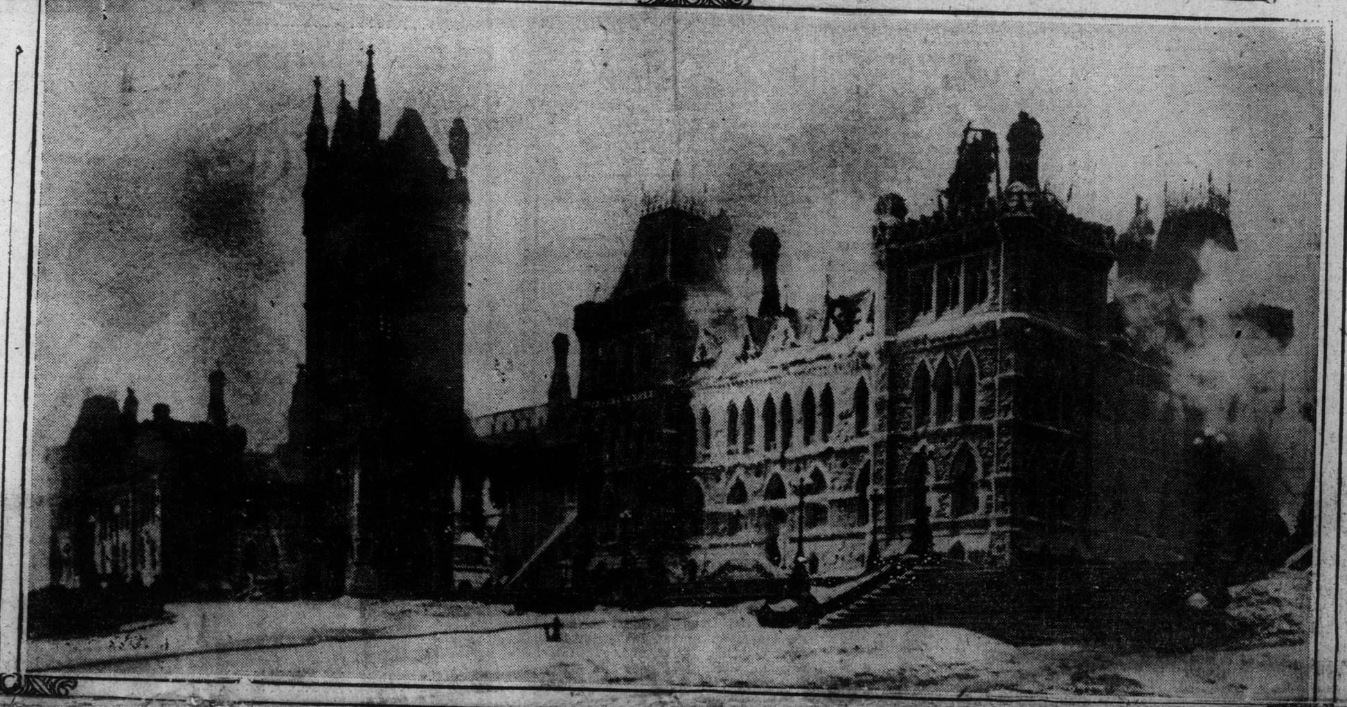
HERE IS SHOWN THE RUINS OF THE FAMOUS PARLIAMENT BUILDING AT OTTAWA, WHICH WAS DESTROYED BY FIRE, WHICH IS BELIEVED STARTED FROM AN EXPLOSION FROM AN INCENDIARY BOMB OR A FIRE STREADING INFERNAL MACHINE. AS RESULT OF THE PEOPLE OF CANADA ARE ASKING THEMSELVES IF THEY ARE IN FOR A REIGN OF BOMB TERRORS SIMILAR TO THOSE PERPETRATED IN THE UNITED STATES.