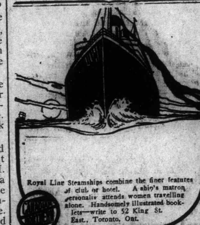
Royal Line Steamships combine the finer features of all the world's ships. A ship's master, generally, attends women travelling alone. Handily illustrated booklet—write to 52 King St. East, Toronto, Ont.