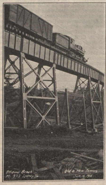
Ottawa Brook Steel Viaduct, showing new steel work in place, and old partly taken down.

of this bridge were replaced with heavier ones during the winter of 1915-16, by the Dominion Bridge Co., which company built the old bridge in 1888. The new swing span is operated by a 4-cylinder, 4-cycle marine engine, located in a cabin