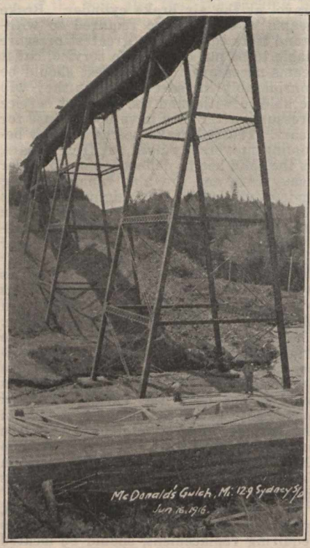
McDonald's Gulch, showing construction of rail concrete culvert, before filling commenced.

It would be impossible to give anything here but a very brief description of the more important portions of this work. Eight steel bridges were replaced with heavier spans during 1916, including the big bridge at Grand Narrows, necessitating in most cases quite extensive alterations to the old masonry abutments and piers. Two steel viaducts have been entirely replaced with steelwork of a heavier design, on new concrete pedestals and abutments, viz., Ottawa Brook and Walker's Gulch, and 5 steel viaducts have been filled in. This extensive bridge replacement work, involving an outlay of approximately $750,000, has made it possible to remove the speed restrictions from all these bridges, and during 1916 we removed the restrictions from 10 bridges.