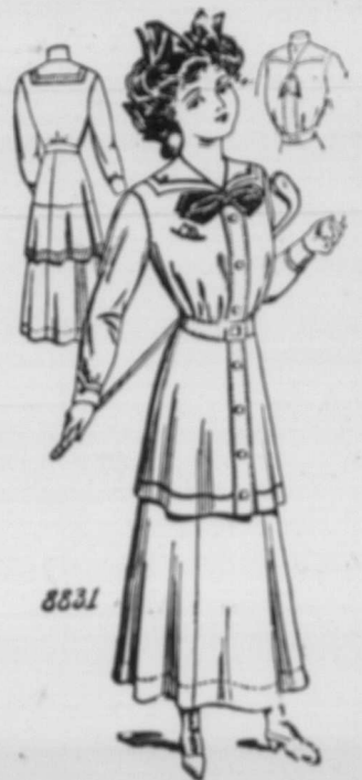
8831.—A Charming Up-to-Date Costume for Misses and Small Women.

A hardware dealer wrote the following to his wholesale house: "Dere sur: I recieve de stove which i by alrite but why don't you send me no feet. what is de use of de stove when he don't have no feet? I am loose to customer sure ting by no having de feet and as dat's no very pleasure to me. what is de matter with you? Is not my trade moneys so good like