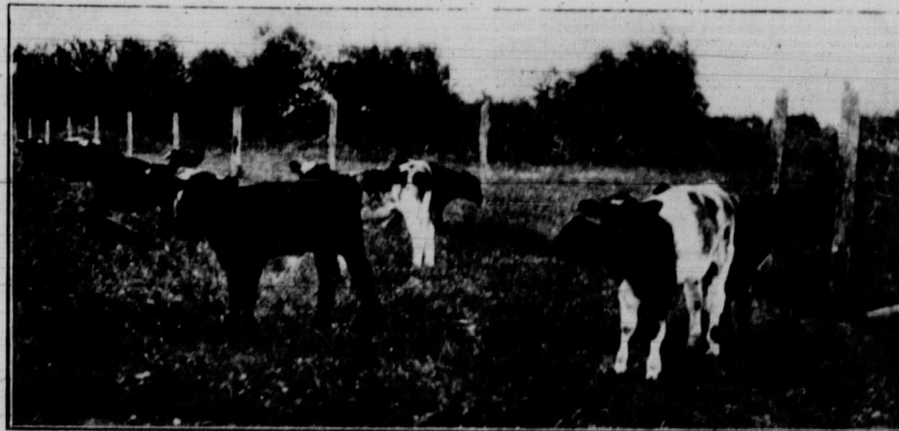
Young stock on the farm of Roberts Bros., Vegreville, Alta.