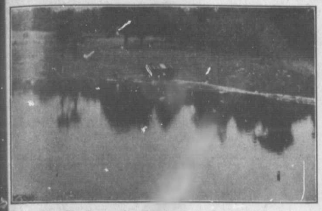
The Source of a Neighborhood's Ice Supply. This artificial pond is on the farm of Watson Bros. Missisquoi Co., Que. Such sond is a great convenience where a natural loc supply is not handy. Probal however, the boys who have just been in swimming, value the pond more highly mile good old summer time."

THE annual Provincial plowing match under the auspices of the of which three were in cotton-growing sections, two in the corn belt, two ing sections, two in the corn belt, two ing sections, two in the corn belt, two in special dairy sections. The average annual value of food, fuel, oil, and shelter per person for prizes will be offered. In addition to