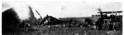
Cupar, Sask., Dec. 9th, 1912

Gentlemen:—Am pleased to say that the Hart-Brown Wing Carriers and Dump Racks purchased through you this fall have given entire satisfaction.