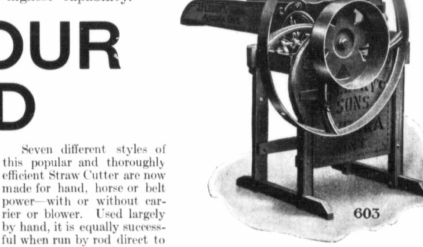
Fleury's Straw Cutter No. 2

Frame of steel, angle bars well braced and strongly rivetted together. Main Shaft is of fine machinery steel, of great wearing quality, running in boxes bab-bitted with high grade metal. On the table is bolted a hardwood board and in end of table near the saw is placed a roller which carries the timber to the saw.