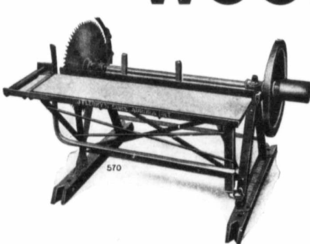
Fleury's Circular Saw Machine No. 3

and effective dual-purpose machines now in use. The construction and finish are perfect. Thousands of them are now in active service and