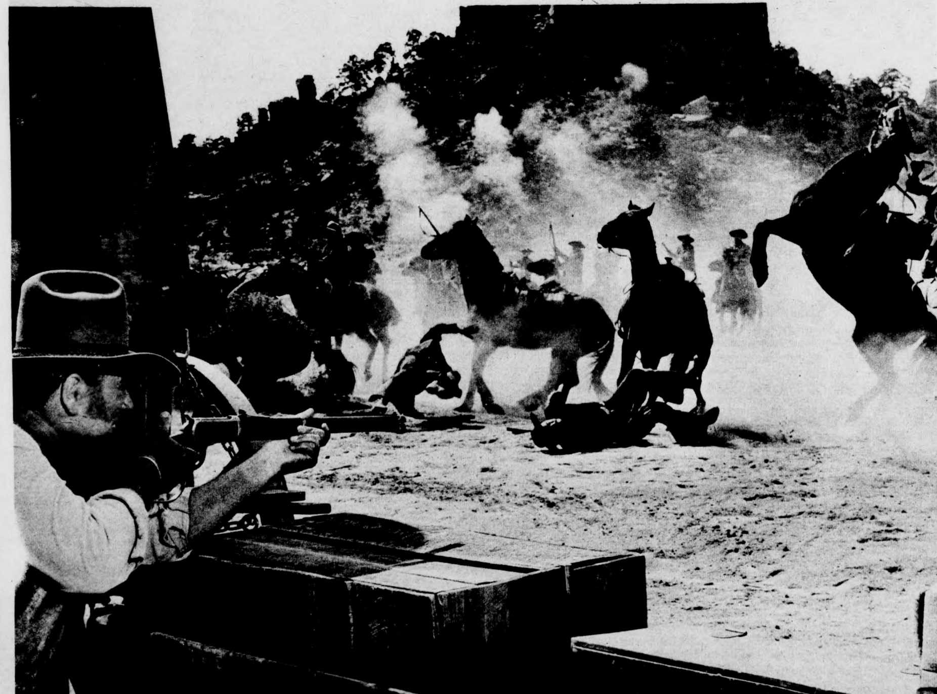
John Wayne was a new superstar.

the movie was as a straight Western, it was regrettably apparent that the Western has become politically-oriented.