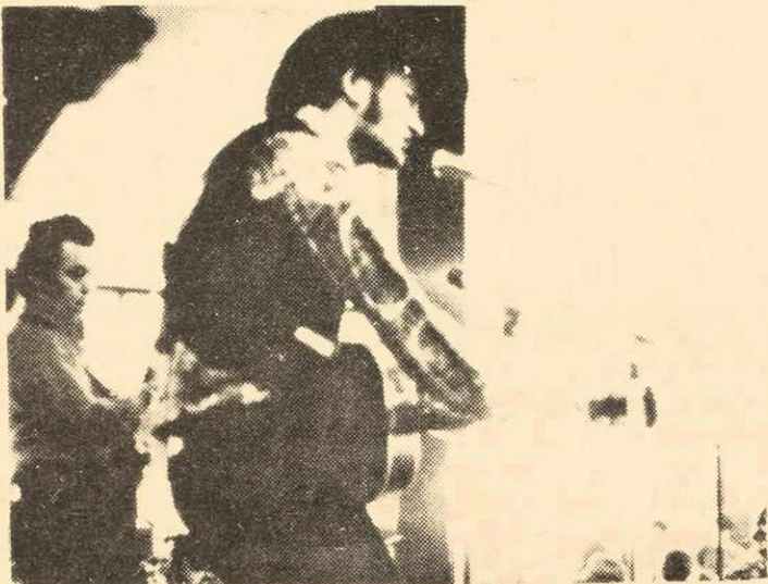
Stompin' Tom Connors at the Lumberjack brawl.