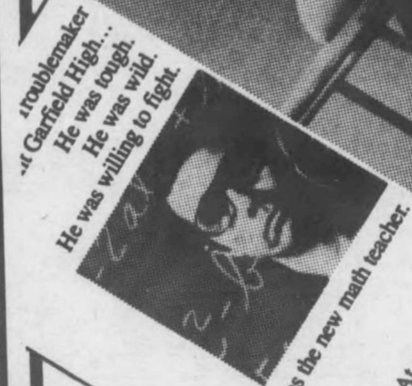
troublemaker at Garrard High... He was tough. He was wild. He was willing to fight.