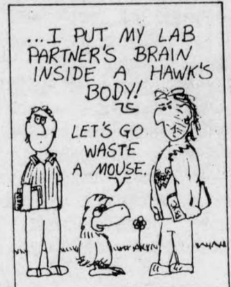
By GARY LARSON