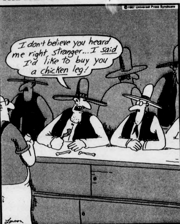
In the Old West, vegetarians were often shot with little provocation.

In the early days, living in their squalid apartment, all three shared dreams of success. In the end, however, Bob the Spoon and Ernie the Fork wound up in an old silverware drawer and only Mac