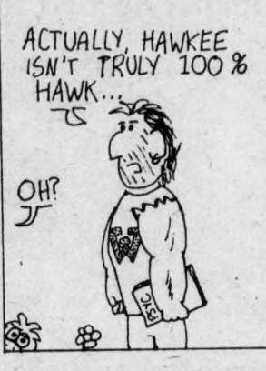
By GARY LARSON