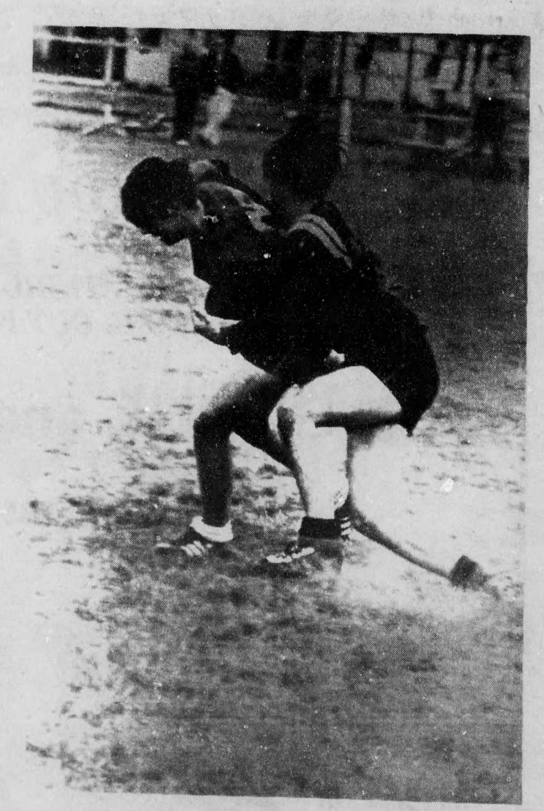
Maybe an unorthodox way to stop your opponent, though nevertheless effective.

Anyway if you have some excess energy we recommend you to pop over and see the person in charge.