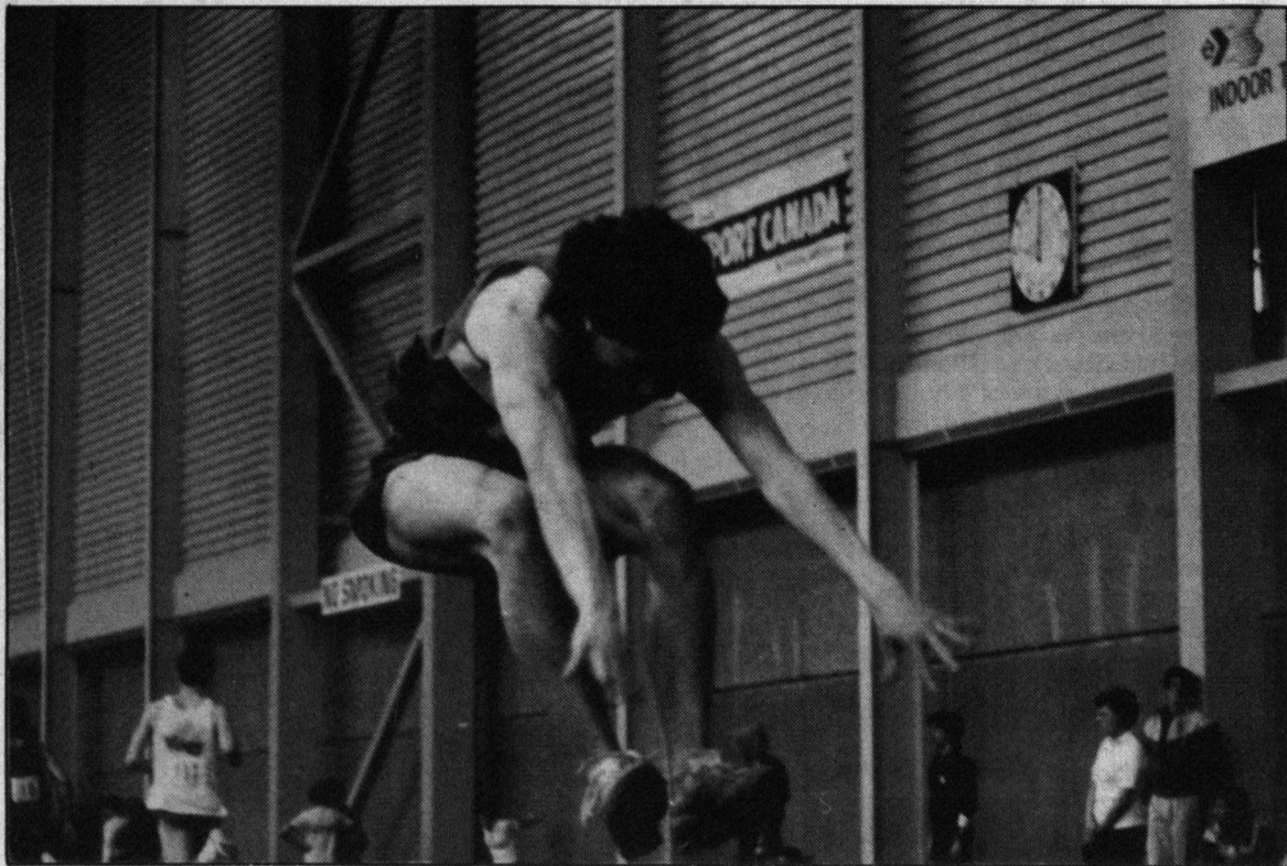
The Bears took seventh place at the CIAU's, while the Pandas placed third. (file photo)