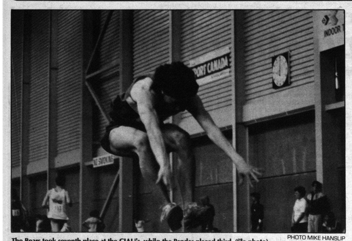
The Bears took seventh place at the CIAU's, while the Pandas placed third. (file photo)