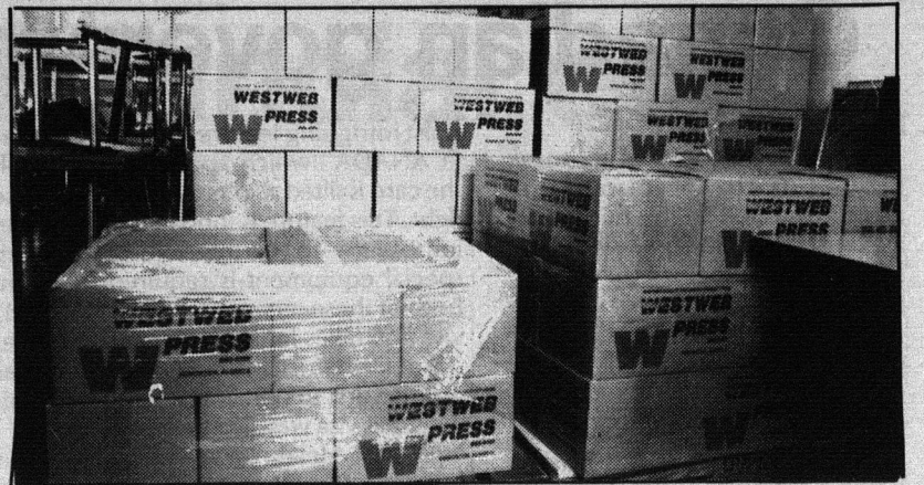
Stacks of handbooks waiting for a home