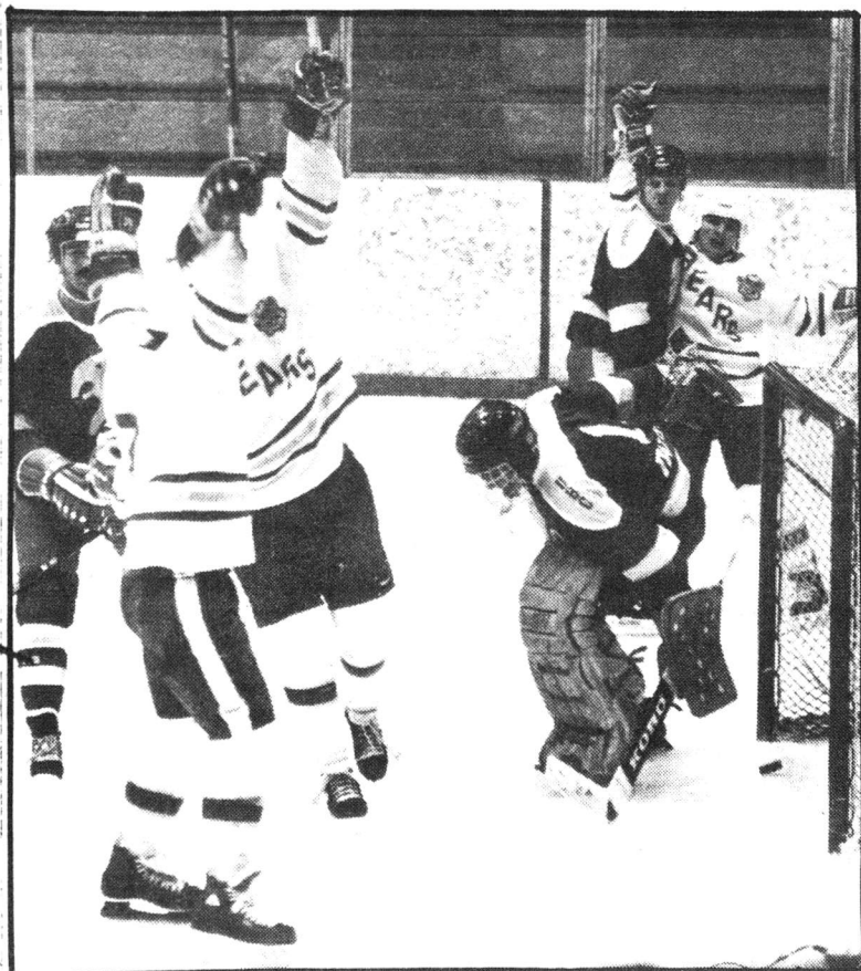
Golden Bears host Junior Invitational Sept. 19-22 at the Varsity Arena.

DEADLINE FOR APPLICATION: September 24, 1985.