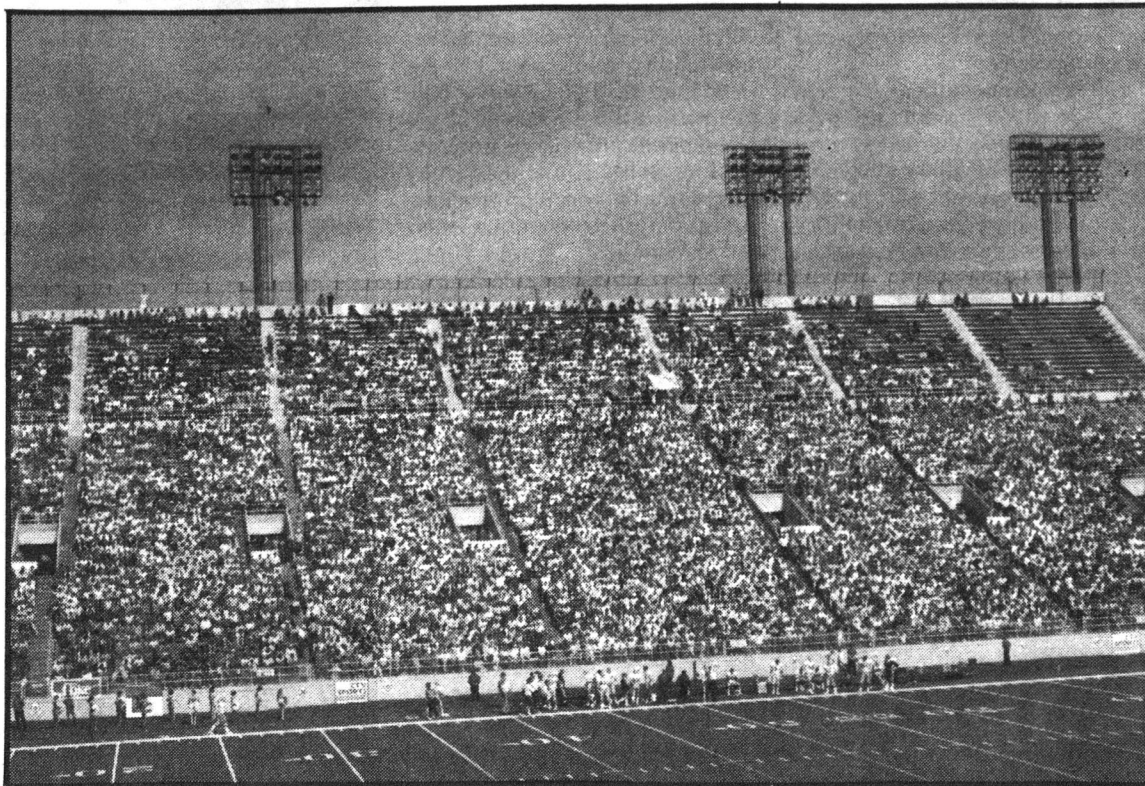
McMahon stadium. It doesn't get any fuller

"Of course in those days we could count on at least four or five