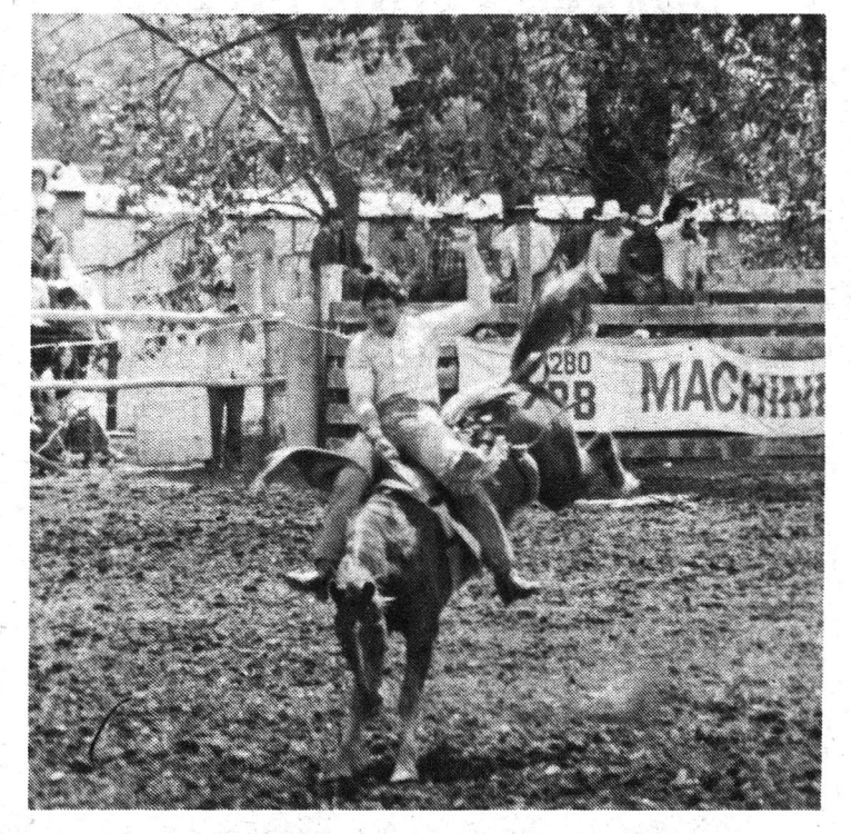
A rodeo club member tries to make the eight second count.

club — which participates in six rodeos throughout the year — has pulled up its stakes and is moving. This year the Hobbema Agriplex will host the six team competition on April 17-18.