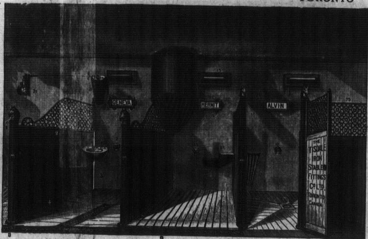
Above Cut Represents Our Stable on Exhibition Grounds, Toronto.