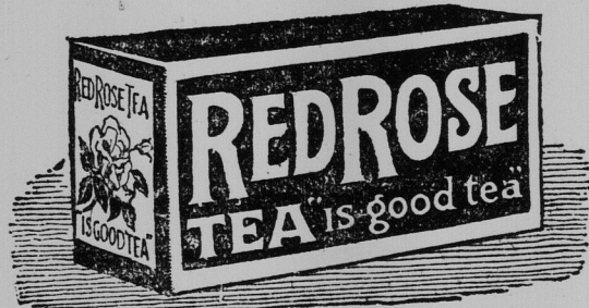
Red Rose Coffee is as generally good as Red Rose Tea

Make a brewing and you will find all these qualities combined in Red Rose.