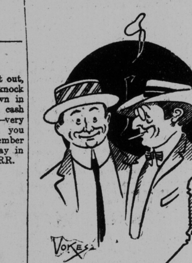
NEW THE GAME

Jim—Yes, while summer boating, I fell in love with the farmer's daughter. Jack—Simple child of nature, eh? Jim—Not exactly. She gave me to understand that her father did not allow any rebate on the board bills of her beaux.