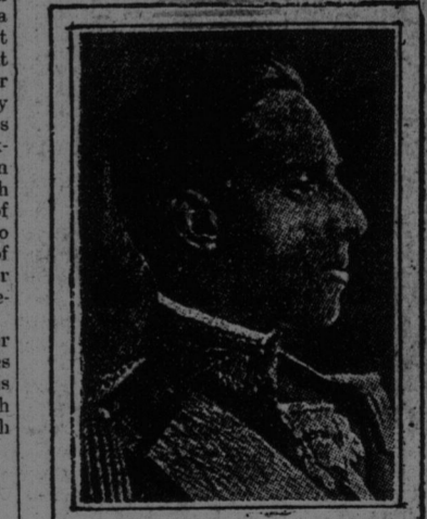
KING ALFONSO XIII.

Washington, Dec. 24.—Never again will he head another expedition either to the North Pole or the South Pole. This announcement was made last night by Commander Peary. He stands ready, however, to assist any expedition which contemplates setting out for either extremity of the earth.