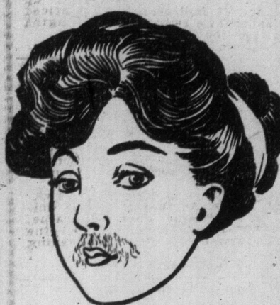
Need Now For Hair on the Face. Cure With Elec-tro-la is a Cure That Lasts.

columns of this paper that free treatment would be sent to every woman who suffered from superfluous hair on her face, arms or bust. So many ladies accepted this generous offer that 50,000 bottles were quickly exhausted and as requests are still coming from women in all parts of the country it has been decided to continue the offer for a while longer at least.