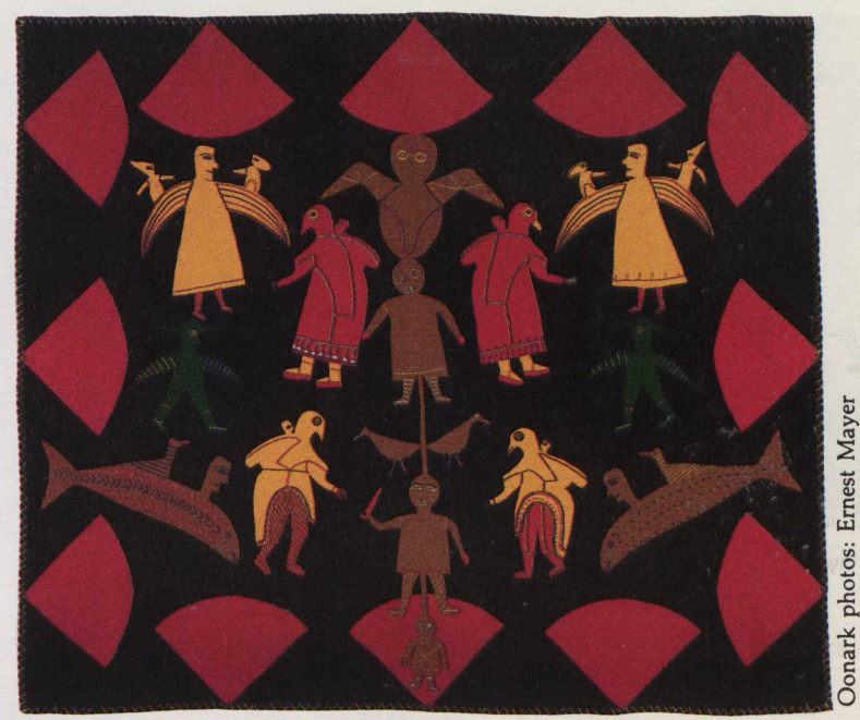
Wall hanging, 121.5 x 138.2 cm., c. 1970.

Oonark's versatility enabled her to switch back and forth from drawing to sewing, paper to cloth, flat to textured, small to large. She worked with a variety of materials including coloured pencil, felt-tip pen, brush and ink and coloured paper.