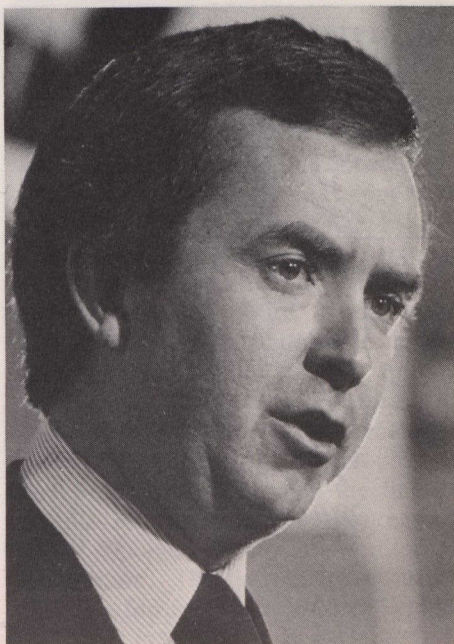
"Our partnership...begins tonight..." said Joe Clark, Prime Minister-elect May 22.

Mr. Clark thanked his supporters and "all the people of Canada for giving a new direction of the affairs of a great nation". He continued: "We tonight have been given that responsibility and we will begin tomorrow the planning and preparation to give this country a Government which will stimulate the economy, generate growth in jobs for Canadians, a Government which will strengthen the institu-