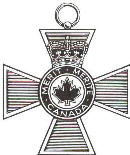
Order of Military Merit

Queen Elizabeth is Sovereign, the Governor General is Chancellor and the Chief of the Defence Staff, General Jacques Dextraze, who was also in attendance is, by virtue of his office, the Principal Commander. Earlier this year General Dextraze was invested