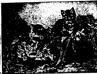
A KITTEN FAMILY. Size, 17 x 18 in. One of 33 studies to be given in a $4 subscription. To be published April 25, 1891. For sale by newsdealers.

Among them are an oblong marine; a "Moonlight on the Snow"; Japanese lilies; "On the