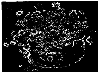
DAISIES IN BLUE NEW ENGLAND TEAPOT. One of 33 studies given in a $4 subscription.

Catalogue of studies and descriptive circular sent for stamp.