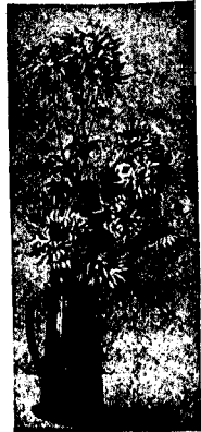
YELLOW CHRYSANTHEMUMS. Size, 33 x 14 in. One of 33 studies to be given in a $4 subscription. To be published April 11, '91. For sale by newsdealers.

Coast of Maine"; full-length study of an Arab Deer's Head; a charming Lake View; three beautiful landscapes in oil: "Spring-