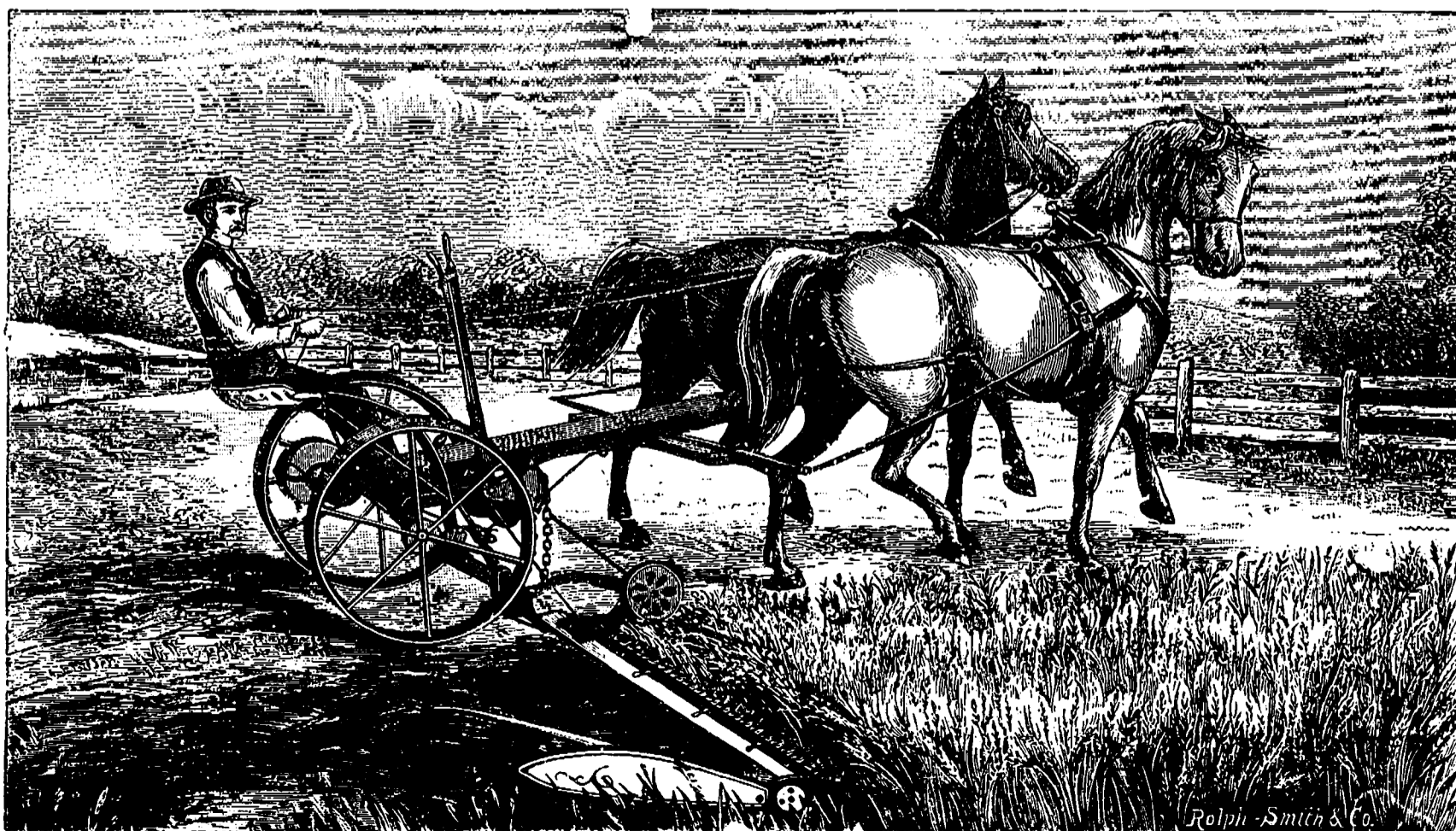
THE MASSEY MOWER.