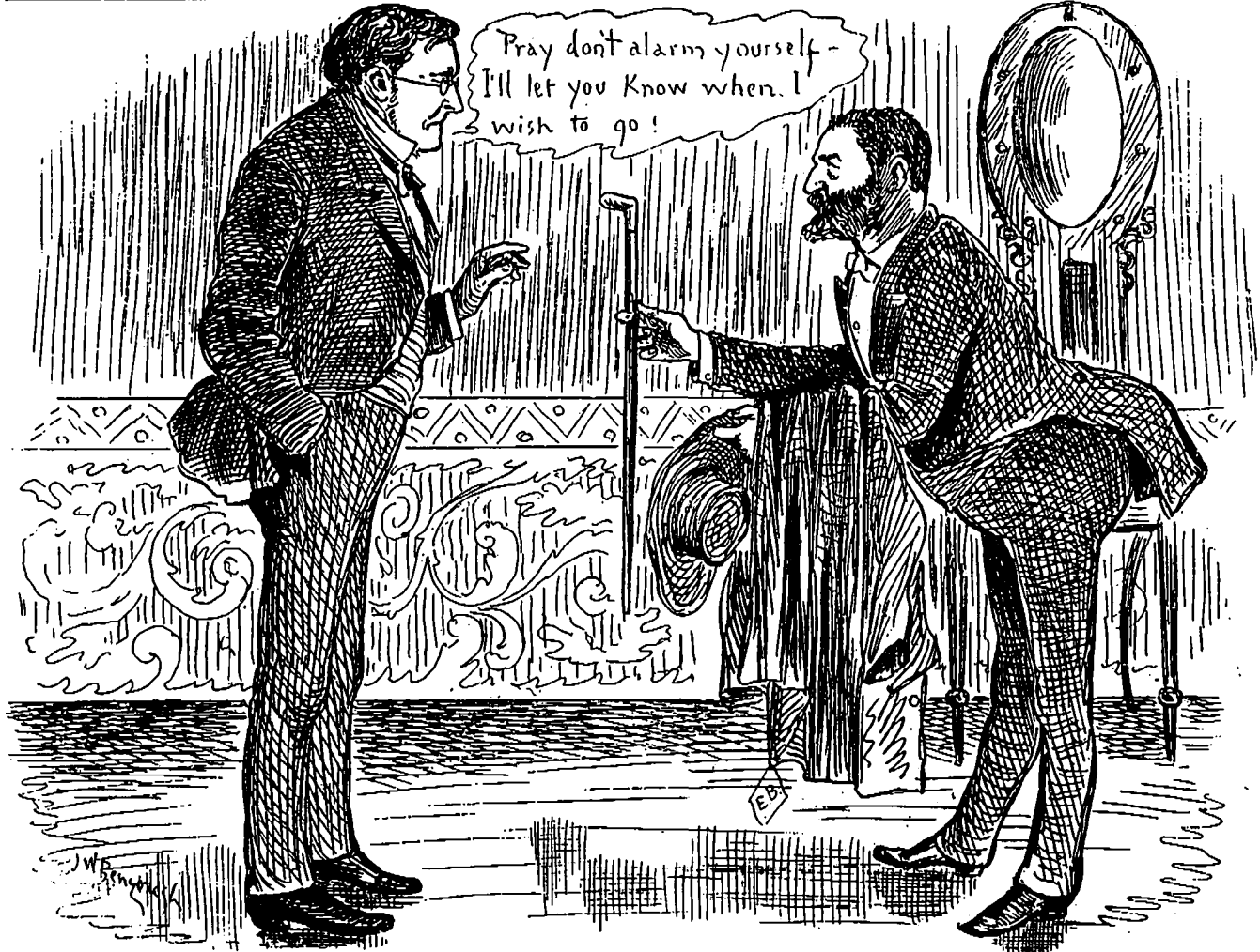
A LITTLE TOO PREVIOUS!