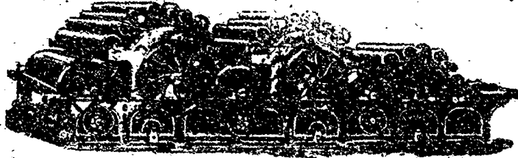
English Sales Attended.