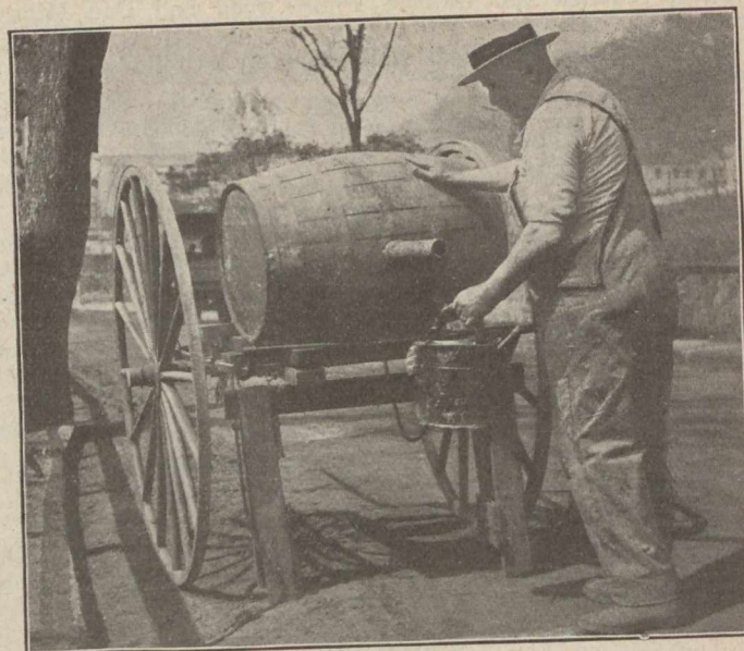
FIG. 2—THIS RIG COST JUST TWO DOLLARS

Often an old house or shed may be acquired for a patrol house. A little repairing or painting will make it suitable and attractive. Nor is it necessary to provide new and expensive equipment throughout. Fig. 2 shows how a bar-