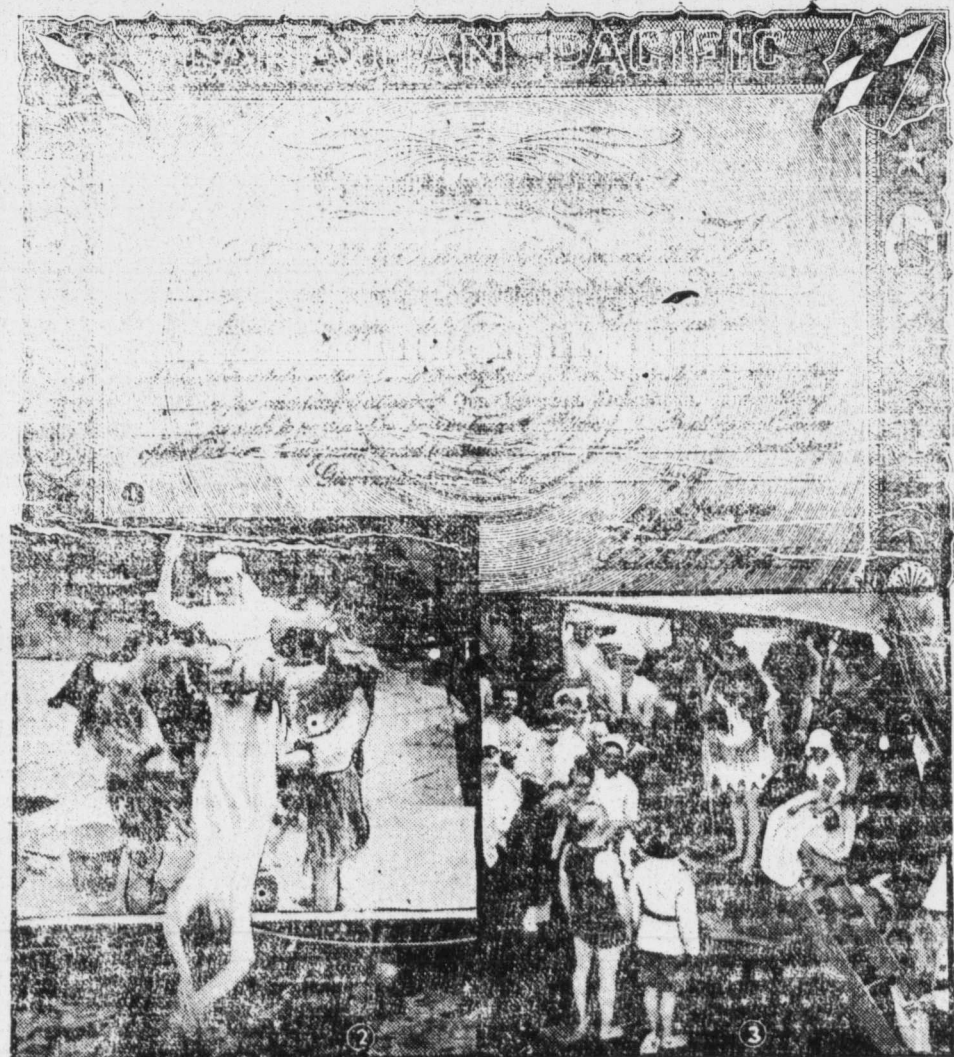
The certificate as shown above will be issued to all passengers aboard the Empress of Canada who appear before Neptune, as did those passengers on the Empress of France last year, who are shown in pictures 2 and 3.

When to travel upon the sea was to venture in great danger it was usually thought wise by the voyagers to propitiate the god of the waters by making gifts to him before setting sail, and oftentimes, when Neptune dis- played his wrath at sea, human sacrifices were made to him. To our superstitious ancestors the son of Saturn and Ops had great power over the waves, especially those of the sea, and had, therefore, in his hands the welfare of all vessels and their human and other freight. The worship of Neptune was early introduced into Rome, and July 23rd, "Neptunalia," was his feast.