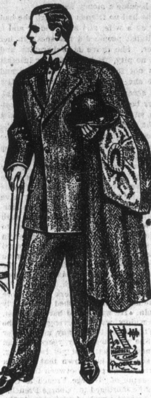
PROGRESS BRAND CLOTHING

ALL OVERCOATS, REEFERS, FUR COATS, UNDERWEAR AT GREATLY REDUCED PRICES.