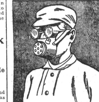
NURSE IN WHEAT HOSPITAL.

Plants and flowers are subject to disease, and the loss of crops throughout Canada and the United States alone has been estimated at some $18,000,000 it becomes impera-