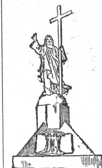
ARGENTINA AND CHILI PEACE MONUMENT.

Very fitting were the celebrations held recently on the frontier of Argentina and Chili to commemorate the lasting peace brought about between those two Republics by the arbitration award as to their boundary given by King Edward VII. two years ago. A gathering of the most notable men of both countries, accompanied by the British Ministers to Argentina and Chili, assembled on the Uspallata Pass of the vast range of mountains known as the Cordillera de los Andes, which mark the dividing line between the two nations. It had been decided to erect