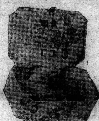
OF BRIGHT COLORED CRETONNE.

Give Her a Sewing Box. Easily constructed is a new model vorkbags of the size that is nice to have about the table in the living oom. To make it cover with plain silk, a pair of disks of about three inches diameter and shirr about the lower half of each of these the oppo site edges of a yard long strip of sash ibbon. This makes a collapsible re eptacle with a wide mouth, which may be drawn together by ribbon hangers attached to the top edges of the disks. On the inner side of the asteboard circles may be affixed flat round cushions for the accommodation of needles and pins, and to the outer side may be suspended scissors and