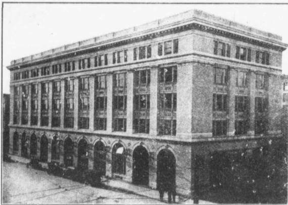
B. C. Electric Interurban Terminal at Vancouver.

No Visitor to Vancouver has seen the Coast District until he has taken the trip from