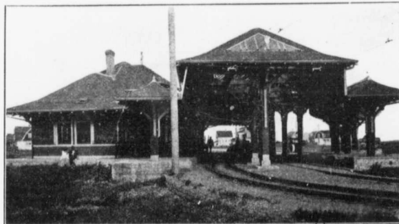
B. C. Electric Station at Chilliwack.

The running schedule is so arranged that the Round Trip may be made in one day, with a stopover of six hours at Chilliwack.