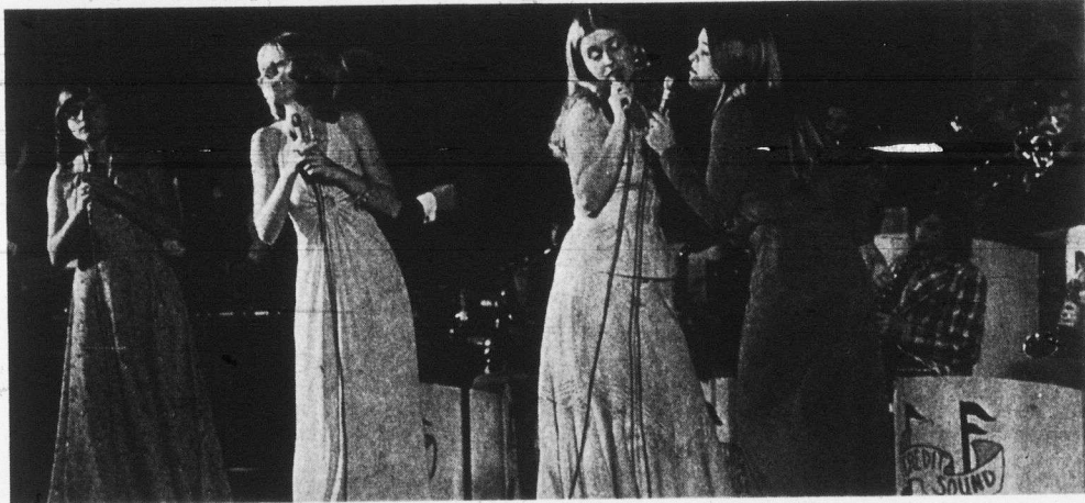
No it's not the Andrews sisters. A lovely Port Credit foursome performed at the high school's annual Christmas party last week.