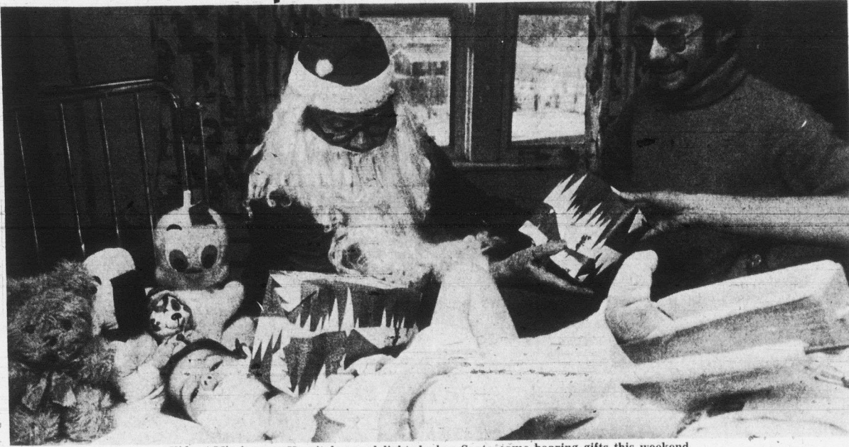
Kids at Mississauga Hospital were delighted when Santa came bearing gifts this weekend.