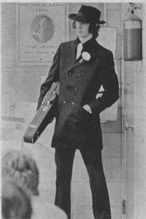
AI will protect you