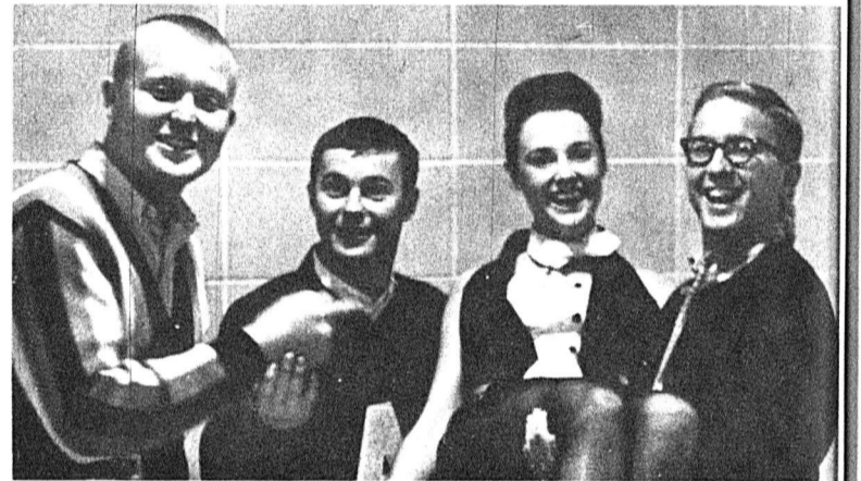
BEARS SUPREME —The U of A Golden Bears are seen with a trophy picked up in Calgary at the weekend, after their 71-0 rout of the UAC Dinosaurs. The trophy is emblematic of football supremacy between the two campuses.

After the first exchange game with Calgary, some felt the UAC had started to play football of a quality found only in Edmonton. This weekend's fiasco seemed to show this to be an illusion, with it apparent that the Bear's competition is again pitiful.