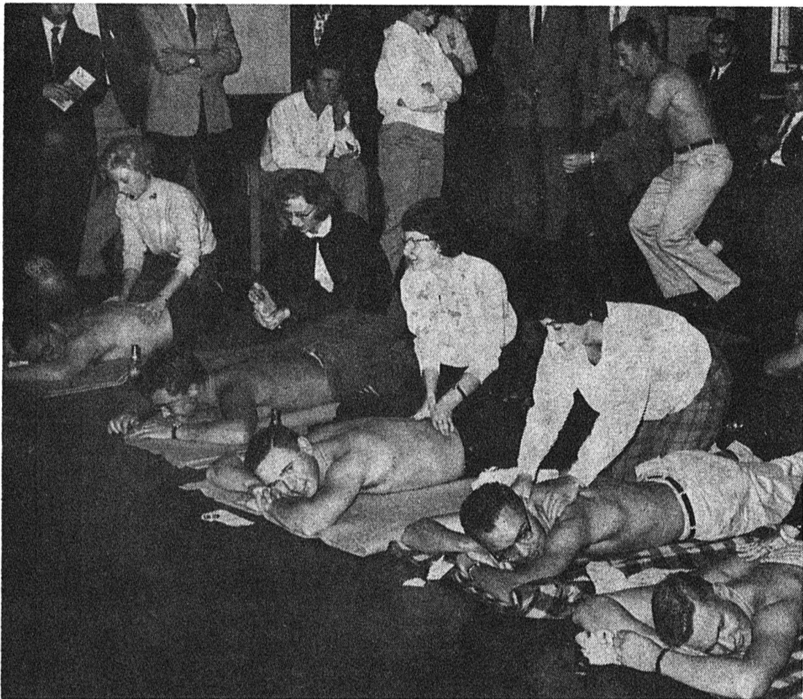
THIS IS LIFE at the University of Alberta—once in a while. Shown above are happy men in residence being happily massaged by amiable nurses from the University Hospital. In the background may be seen one male student gaily romping about the room while taking his shirt off for a massage. The rubbing stimulated the WUS fund drive.