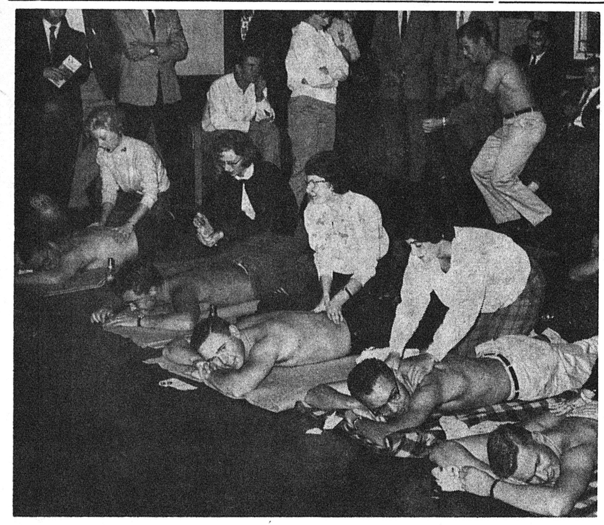
THIS IS LIFE at the University of Alberta | In the background may be seen one male —once in a while. Shown above are happy men in residence being happily massaged by amiable nurses from the University Hospital. | stimulated the WUS fund drive.

student gaily romping about the room while taking his shirt off for a massage. The rubbing