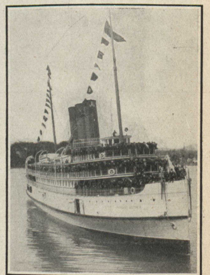
Princess Victoria, just before tying up in Victoria Harbour.

The rate war between the C.P.R. coasting vessels and those operating under the U.S. flag is assuming large proportions. Both the C.P.R. and the International Steamship Co. have advertised the special low rates very extensively, the former line carrying passengers between Victoria and Seattle for 25c., and the latter for 50c. Formerly the regular rate was $2.50. The result of the reduced fare and the advertising was that people thronged down to the boats on the first Sunday and although the Princess Victoria, the Canadian boat, carried 983 passengers and the Chippewa, the rival, carried 1132, there were a large number of disappointed ones who failed to get over to the Canadian city. The Princess Victoria started just one hour after the American boat but she passed her before leaving Puget Sound and when she arrived in Victoria her rival was not in sight.