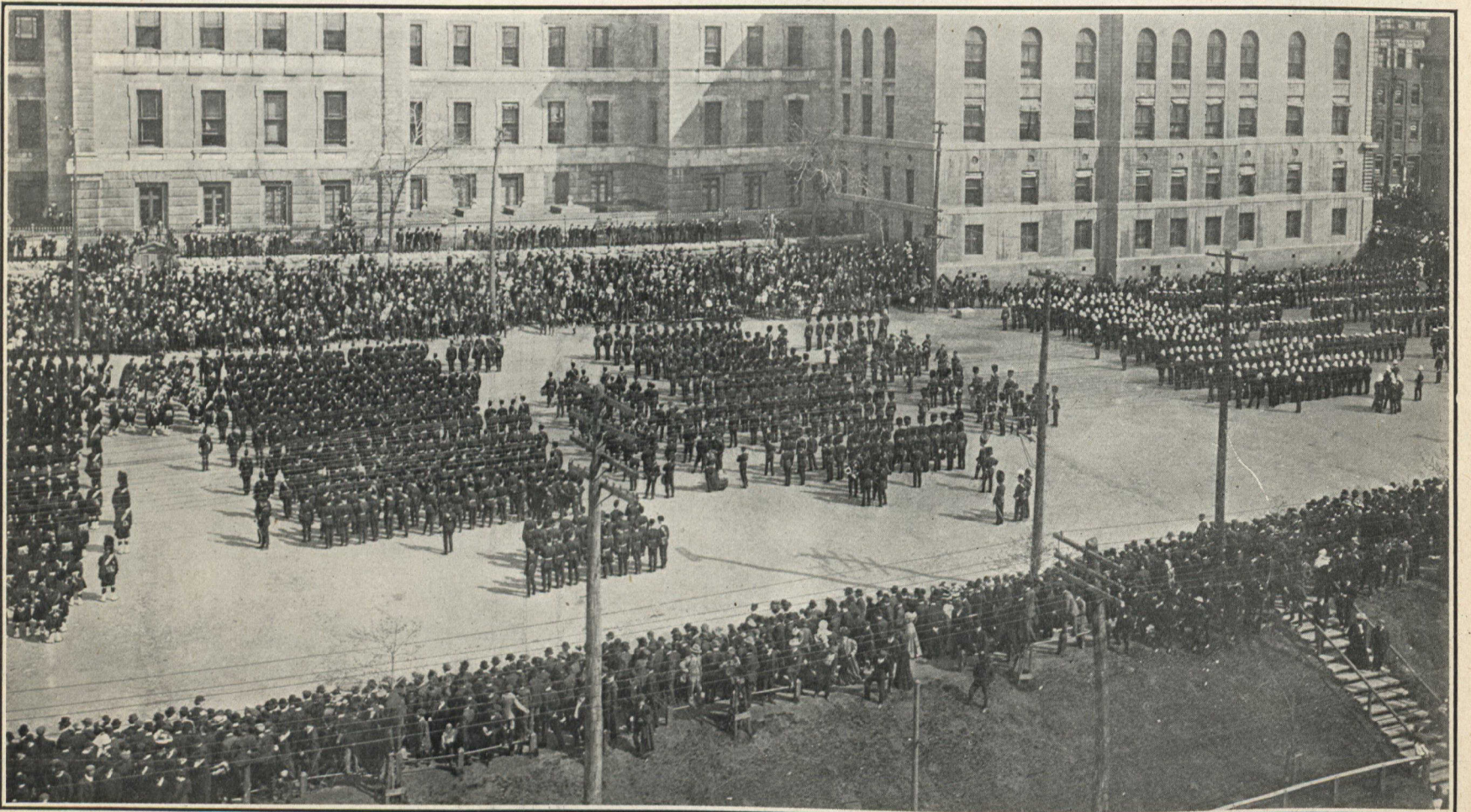
Montreal's Record Military Parade (3,364), on Sunday May 17th.