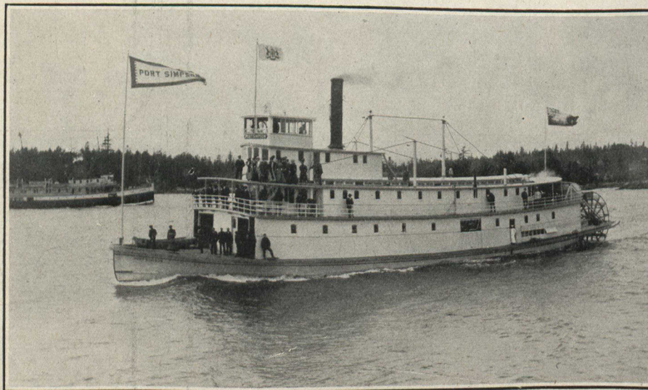
"Hudson Bay" River Steamer Port Simpson, passing out of Victoria Harbour. She will ply on the Skeena River.