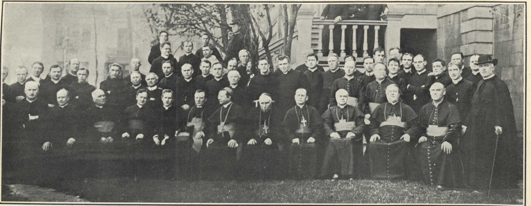
On May 16th, Cardinal Logue, of Ireland, who has been visiting in Canada, was given a special dinner in the Archbishop's Palace in Montreal. The gathering was most representative. This photograph was taken just afterwards. The Cardinal is the eighth from the left in the front row.