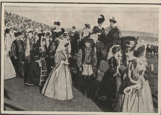
Champlain visits the Court of Henry IV.