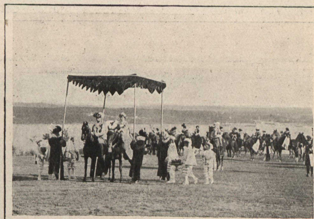
A Court Scene of the Sixteenth Century