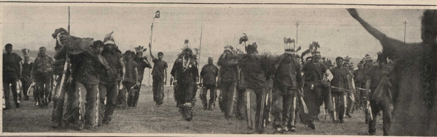
Indians burying the dead after an attack.