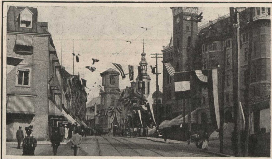
Streets in Gala Attire. City Hall on left, with Basilica in background.