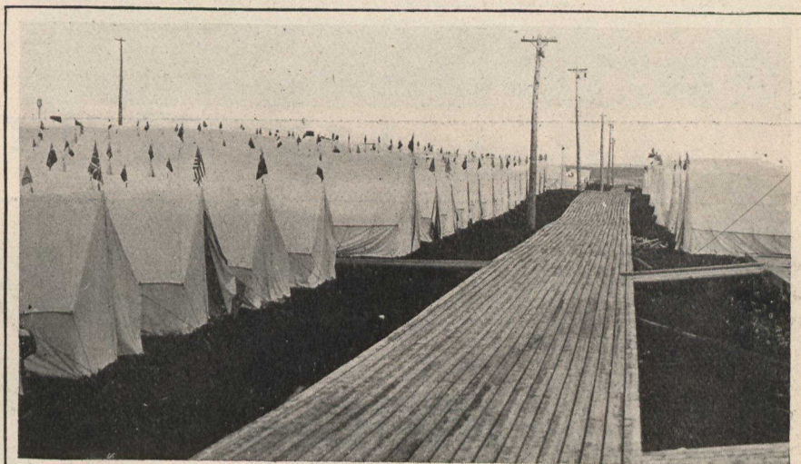
One of the main Avenues in the Tented City, where 4,000 visitors may be entertained.