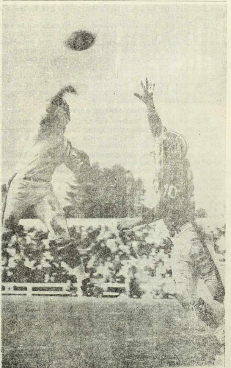
HELP WANTED — The Dal football team ended its season with an 0-7 record. Reason? Not for lack of trying, or lack of coaching, but a lack of talent. The outlook for next year is not much better.