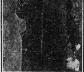
A Modern Hand Grenade.

Kent County Lady Did This—Then She Used Dodd's Kidney Pills and Was Cured.